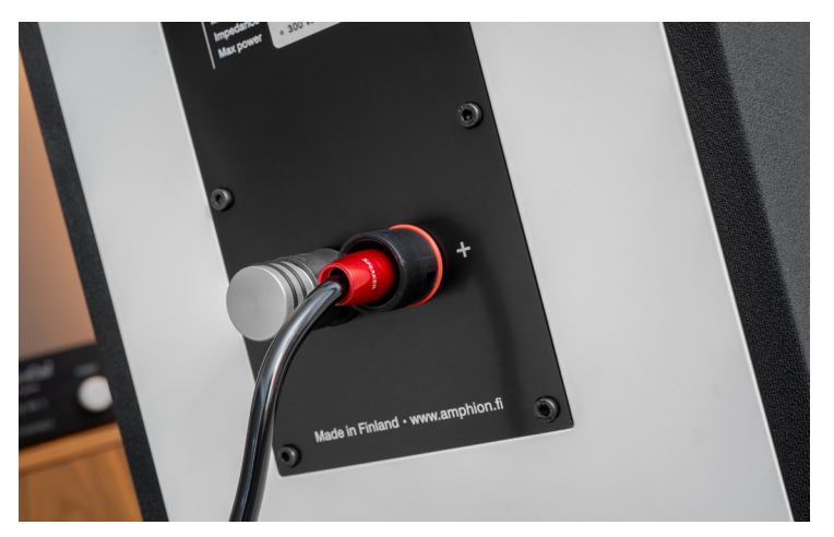
While spade lugs and stranded wires can be pushed into the connections from below and locked in place with the large clamps, banana plugs can simply be inserted from behind instead of the screw terminals.

After connecting the sound columns, I called up the "Milk Bar Seaside Season 10" to brew myself a cosy cup of coffee. What the Amphion Krypton3X does here with rather