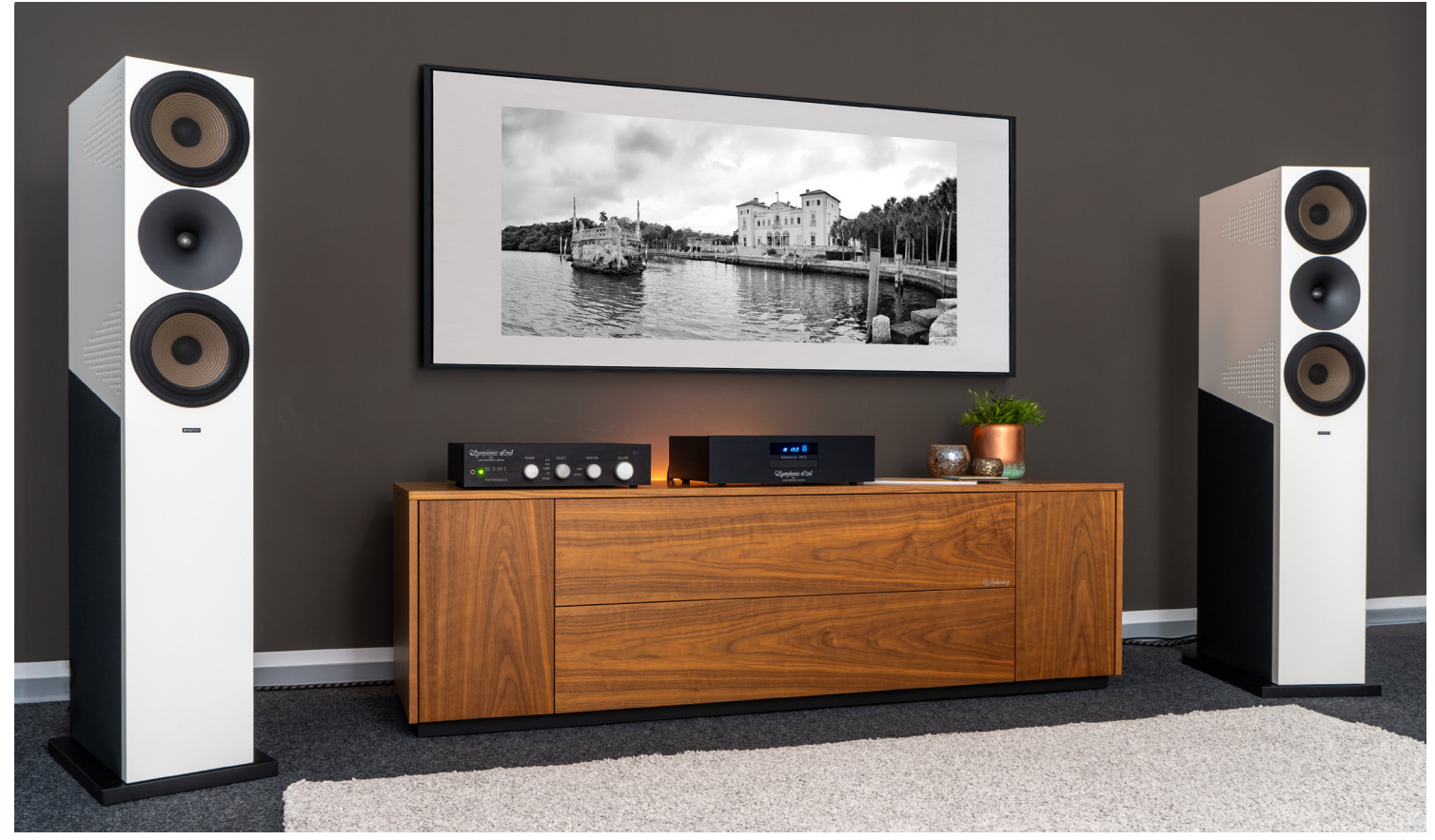
The 25 years of development that have gone into the Krypton3X have by no means aged the speakers visually. The design of the Finnish high-end sound transducers is Nordic-modern.