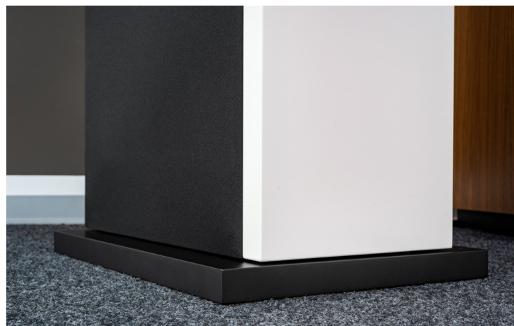
The Amphion speakers are very frugal in their positioning and offer good dispersion behaviour. The stand on the base plate is stable, but no spikes are included.

Inspired by this sonic transparency, I switch to "Limbo" by Yello. The 10-inch woofer picks me up from the very first bar. It delivers the crisp bass of the bass drum without booming. I often have to deal with room modes in this room, but that doesn't seem to bother the Amphion Krypton3X much. The growling basses of the synthesiser also have an incredible sharpness. The outward-facing bass drivers create a wonderfully crisp and wide stage on which the other instruments can let off steam. And Boris Blank knows how to impress in a variety of ways with his fascinating playful sounds. When Dieter Maier's spoken vocals are reproduced here on both stereo channels, you can hardly believe your ears how wonderfully his voice and the bright nuances harmonise with the humming