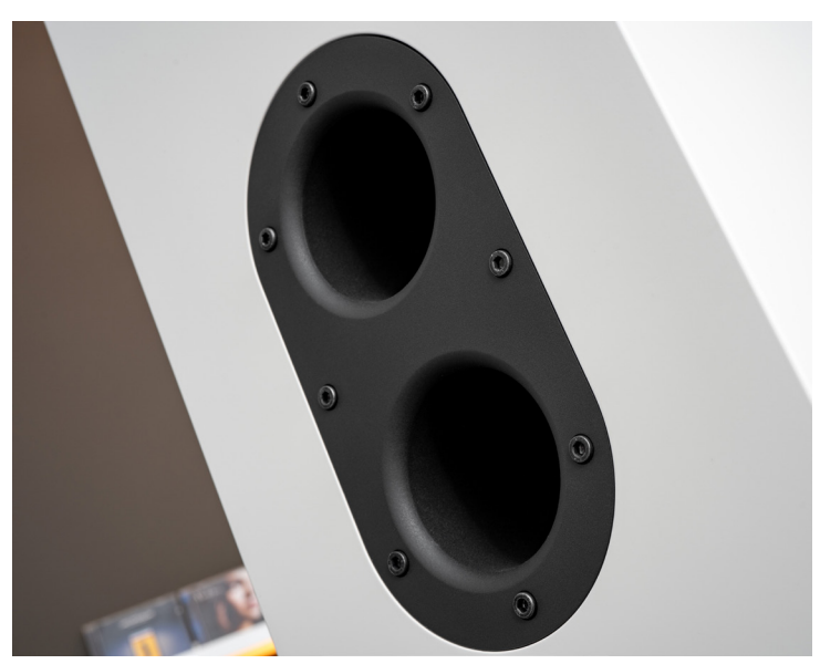
With the help of the bass reflex tuning, the frequency response of the Krypton3X is right down to the lowest ranges. Yet the tweeter also plays far beyond the range of human hearing - reproducing each and every detail.

the entire bandwidth that a loudspeaker can offer. Not only are all drivers confronted with a mixture of hard-hitting and velvety-soft sounds. These sounds also spread throughout the room and are thrown forwards and backwards at the listener. This spectacle should definitely be demonstrated at a local dealer. The gigantic 70-kilogramme behemoths not only bring mass to the scales, they also throw everything into the balance acoustically. The Amphion Krypton3X is particularly good at mixing modern pieces.