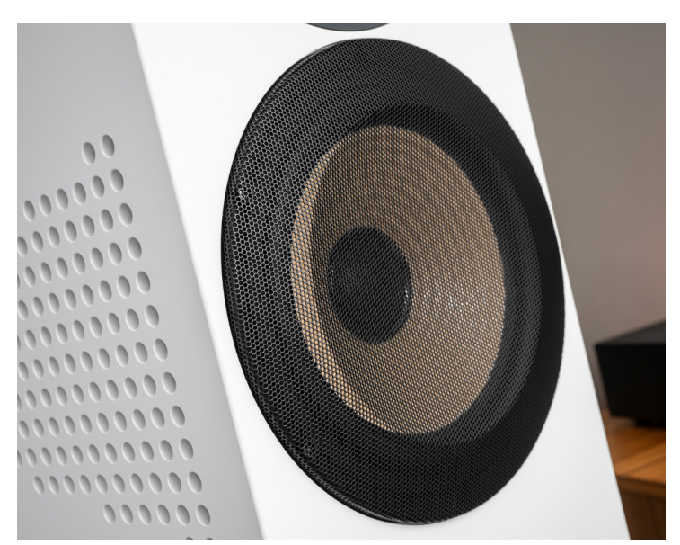
The midrange and tweeter offer a great depth of detail and transparency. Instead of a magnetic fabric cover, each driver has a separate grille cover.

crafted cloud of sound. Amphion has done a really good job in tuning the individual components. You can tell that many years of development work have gone into the Krypton3X.