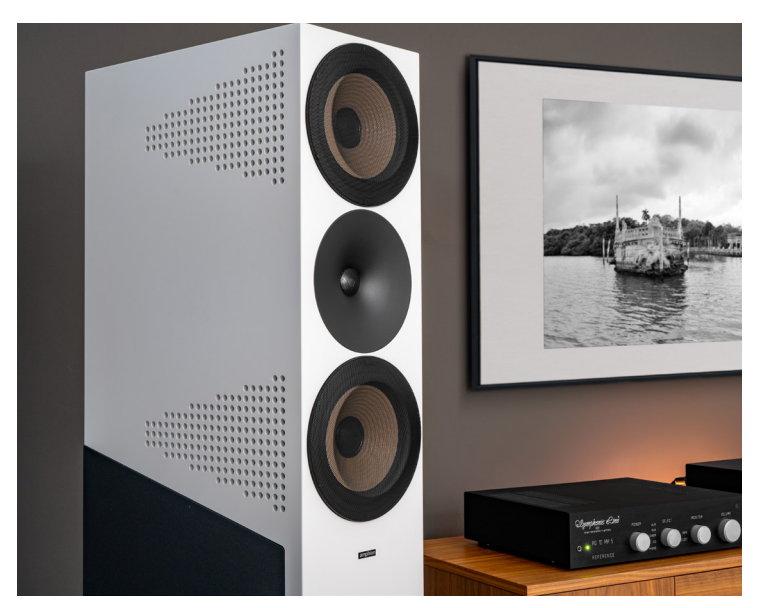
Durch die D'Appolito-Anordnung werden die drei Chassis als einzelne Schallquelle wahrgenommen. Dazu sind genau definierte Abstände und sorgfältige Konstruktion erforderlich.

160 and 1,600 Hertz are unusual. This allows the high-frequency driver to play very far into the range of the mid-range drivers, which in turn can also reach very far down into the bass range. These are out and about as a pair – and together have the necessary surface area. As individual drivers, they boast enough kick to achieve the necessary agility for powerful response. The connection terminal has changed somewhat compared to the older models. The terminal can now incorporate cable lugs or stranded wires as well as banana plugs too. For this purpose, there is a slot at the bottom of the holder through which the cable is fed. The clamps, which are reminiscent of volume controls, are then screwed into the mount and provide a secure hold. This means that the Amphion Krypton3X can be safely controlled with 300 watts.