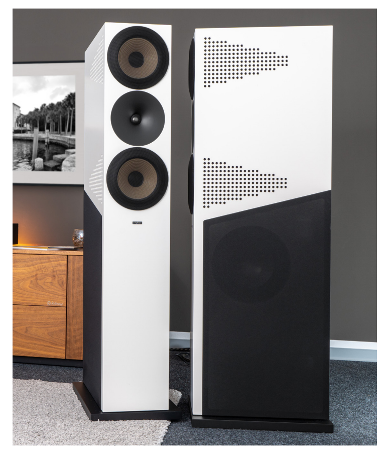
The sturdy housing of the Krypton3X has an excellent finish. Thanks to the side-mounted bass driver, the shape remains quite slim.

This not only looks interesting, but also has a sonic function - which I'm going to come to later. The cones and the waveguide for the tweeter are then fitted into the housing with perfect precision. The screw connection is practically invisible thanks to the metal grille.